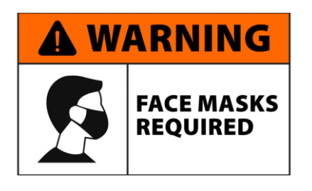
Masks always required over mouth & nose

Please comply with all covid protocols put in place by our organization. We put them in place to protect the health and safety of everyone.