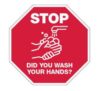
Wash hands after you use the restroom.